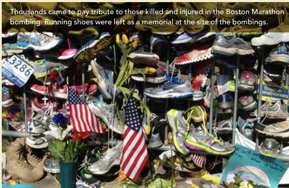
Thousands came to pay tribute to those killed and injured in the Boston Marathon bombing. Running shoes were left as a memorial at the site of the bombings.