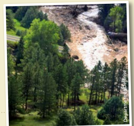
Department of Defense