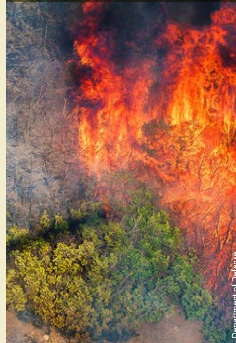
Department of Defense

Colorado citizens experienced tens of millions of dollars worth of damage from fires and floods in 2013.